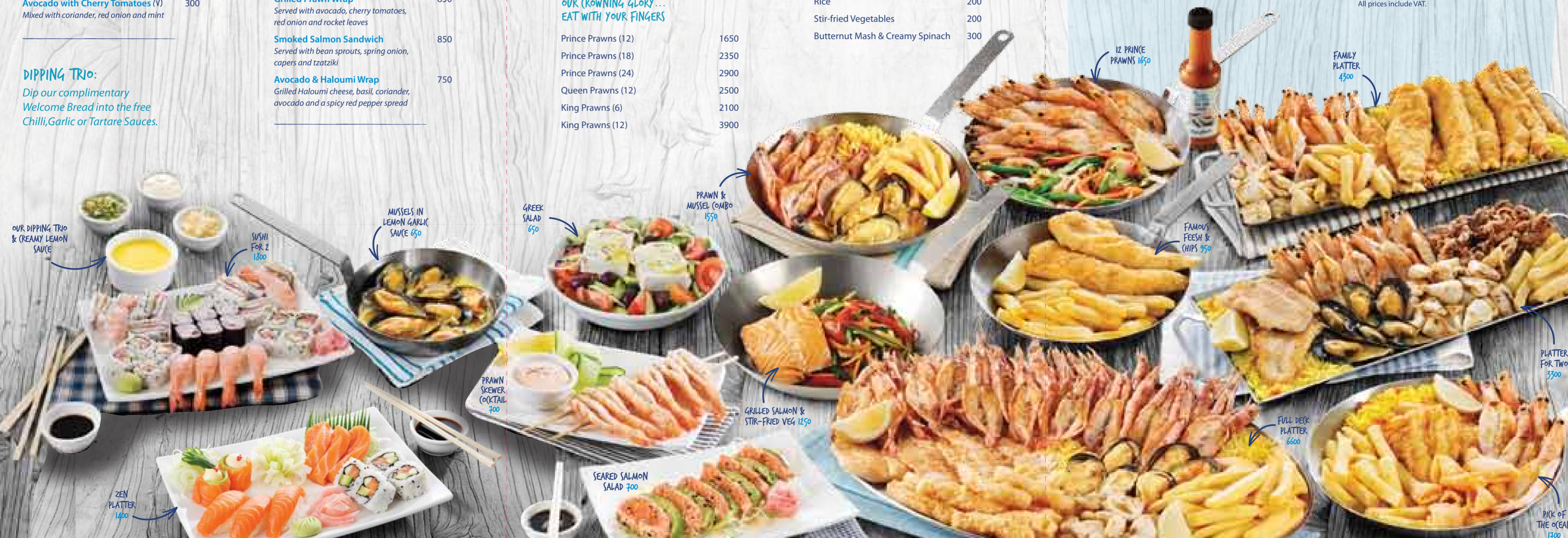
Images are for visual reference only. Size, shape & number of pieces may vary.

Sorry! We do not accept payment by cheque. All prices include VAT.